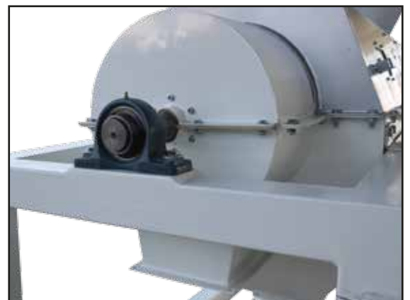
Polishing Machine AK 50-1